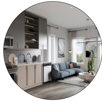
Kitchen & Living Room