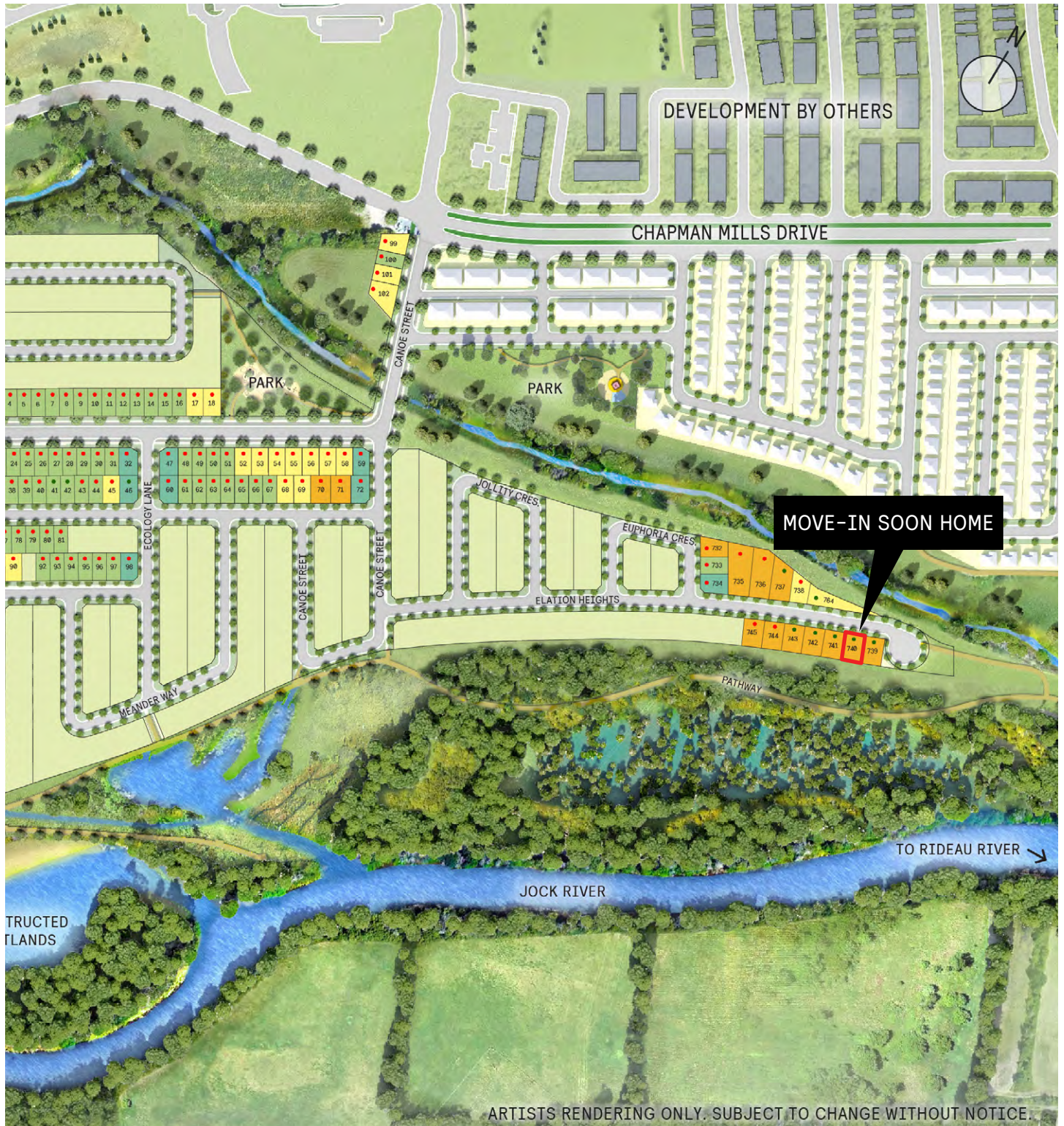
ARTISTS RENDERING ONLY. SUBJECT TO CHANGE WITHOUT NOTICE.